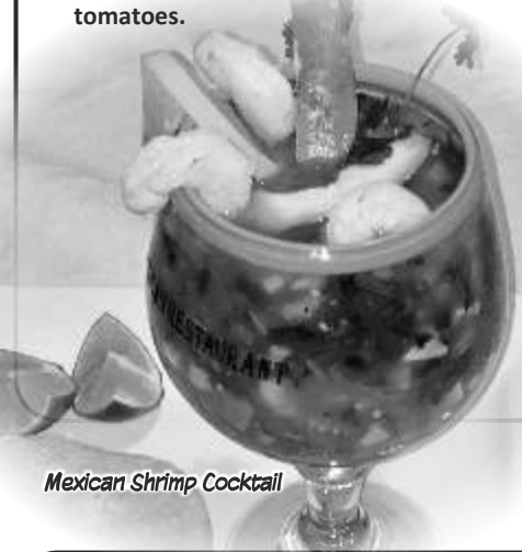
Mexican Shrimp Cocktail